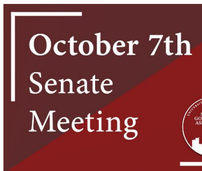
Usage of a serif font, such as Minion Pro or Lora.